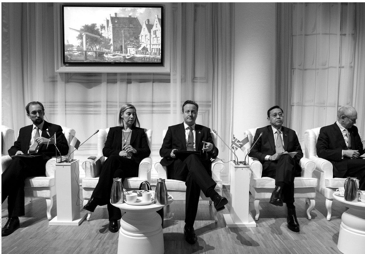
Jordanian envoy to the UN Prince Zeid Raad al-Hussein (L) attends a March 25 session at The Hauge Nuclear Security Summit with several world leaders. Jordan led a joint statement on countering nuclear smuggling.

and Radiological Smuggling workshop hosted by the United States and the European Commission received a technical report with the workshop outcomes and lesson learned. 40