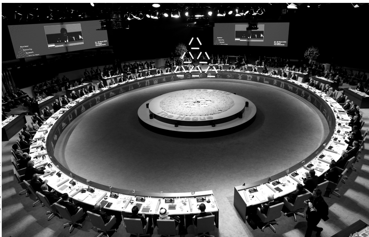
Leaders from 53 countries gathered in The Hague on March 24-25, 2014, for the third Nuclear Security Summit. Leaders signed on to multilateral initiatives to advance nuclear security in key areas at the summit.

Similar to the last edition of this report, the findings presented here support the conclusion that the more successful joint statements identified clear deliverables or outcomes. Such statements facilitated follow-up among participants and included reporting to the international community. They also targeted key gaps in national nuclear security regimes and the international governance system. Inclusion of such elements encourages accountability and provides the political impetus to complete the determined tasks. Joint statements with vague commitments and unclear timetables for implementation were less successful.