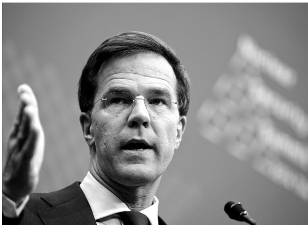
Dutch Prime Minister Mark Rutte addresses the media at the 2014 Nuclear Security Summit. The Netherlands hosted the third summit in The Hague on March 24-25.

It would be a significant loss to allow nuclear security gift basket diplomacy to end after the 2016 summit. The unique blend of high-level commitment making, time-bound follow-up, and targeted collaborative initiatives ignited action on long-held objectives, encouraged new countries to demonstrate leadership, and honed the focus of multilateral institutions with diverse constituencies and mandates. The joint statements, and the NSS process