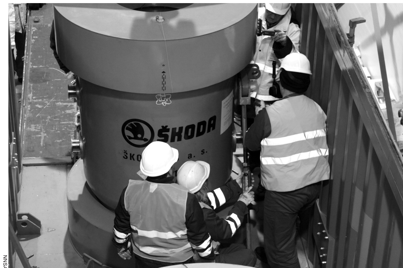
The United States assists in removing highly-enriched uranium from the Czech Republic in 2013. The United States committed to working with four other countries to provide assistance to improve the security of nuclear and radiological materials in transit.

in domestic and international transport. This includes exchanging information on the physical protection of materials in all modes of transport to identify best practices and lessons learned.